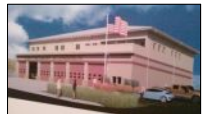
1-Groundbreaking 2-Progress as of 8/18/16

655 East Ridge Road Palmyra PA 17078 717-838-1373